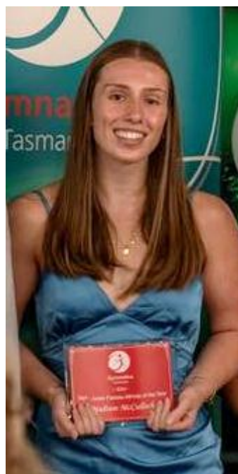
TRP JUNIOR FEMALE ATHLETE