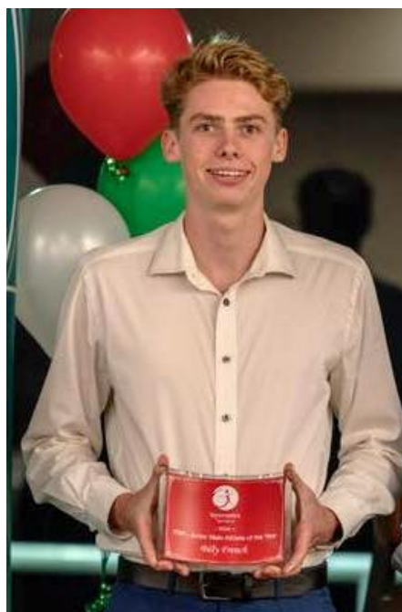
TRP JUNIOR MALE ATHLETE