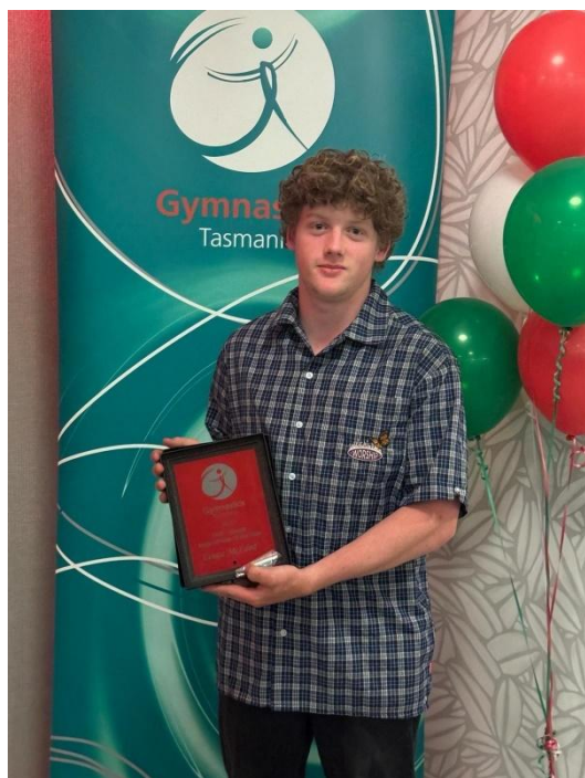
TRP SENIOR MALE ATHLETE