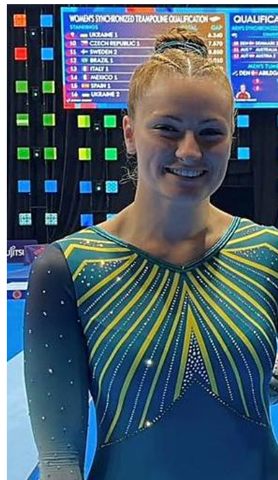
TRP SENIOR FEMALE ATHLETE